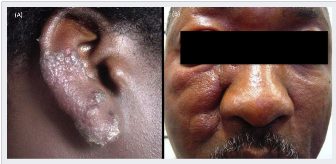
FIG 2 Some examples of cases that can cause diagnostic confusion. (A) Infiltration of the earlobes in atypical cutaneous leishmaniasis, which could be BL or LL. (B) Borderline leprosy, with a differential diagnosis of diffuse cutaneous leishmaniasis.

diagnostic confusion. The confusion occurs mainly with respect to diffuse cutaneous leishmaniasis and lepromatous HD that share infiltrated nodules and plaques with a heavy parasitological load due to their species-specific energy. Conversely, a classical cutaneous leishmaniasis lesion in a subject with preserved cellular immunity against Leishmania is characterized by a typical round ulcer with raised borders on exposed body areas. Usually, this condition is easily distinguished clinically from tuberculoid HD (which represents the high cellular immune pole), where lesions are not ulcerated but rather well-defined anesthetic patches in any region of the body. Some examples are shown in Figure 2.